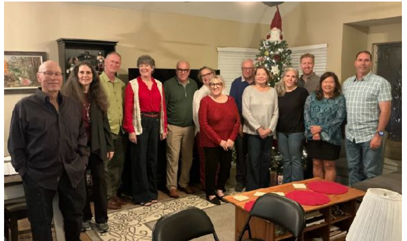
Holiday Party (members and guests)