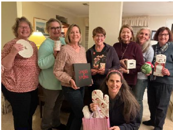
January White Elephant Party