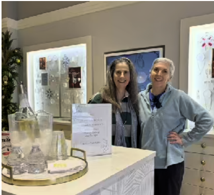
Kendra Scott Event