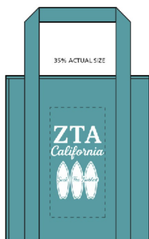
Picture with Zeta design