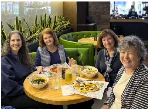
January Zeta Lunch Ladies at True Food Kitchen