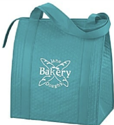
Picture of a similar quilted bag