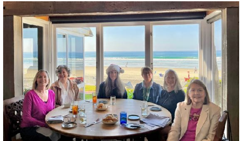
December Zeta Lunch Ladies gathering at Jake's Del Mar.